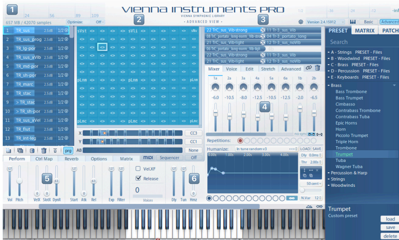
Figure I: Articulate Preset for the Trumpet in C in Vienna Instruments Pro

In addition for the sustained articulation (PC1) of the brass instruments the long portato versions are used to accentuate the attack behavior. Since for Brass 1 instruments the “long portato” sounds are rather short, they are crossfaded into the corresponding sustained sounds when they decay. Therefore, in this particular case the number of voices is further increased during the attack phase. In general the number of voices used for a note played by a given cell is equal to the number of filled slots, whose volume is not set to “-inf”, and can be checked in the Advanced View of VI pro.